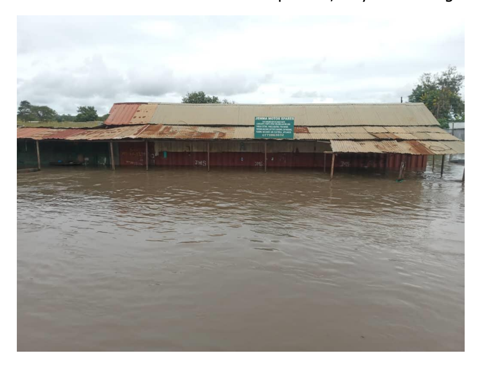
This one is an area towards the main market at Elegu.