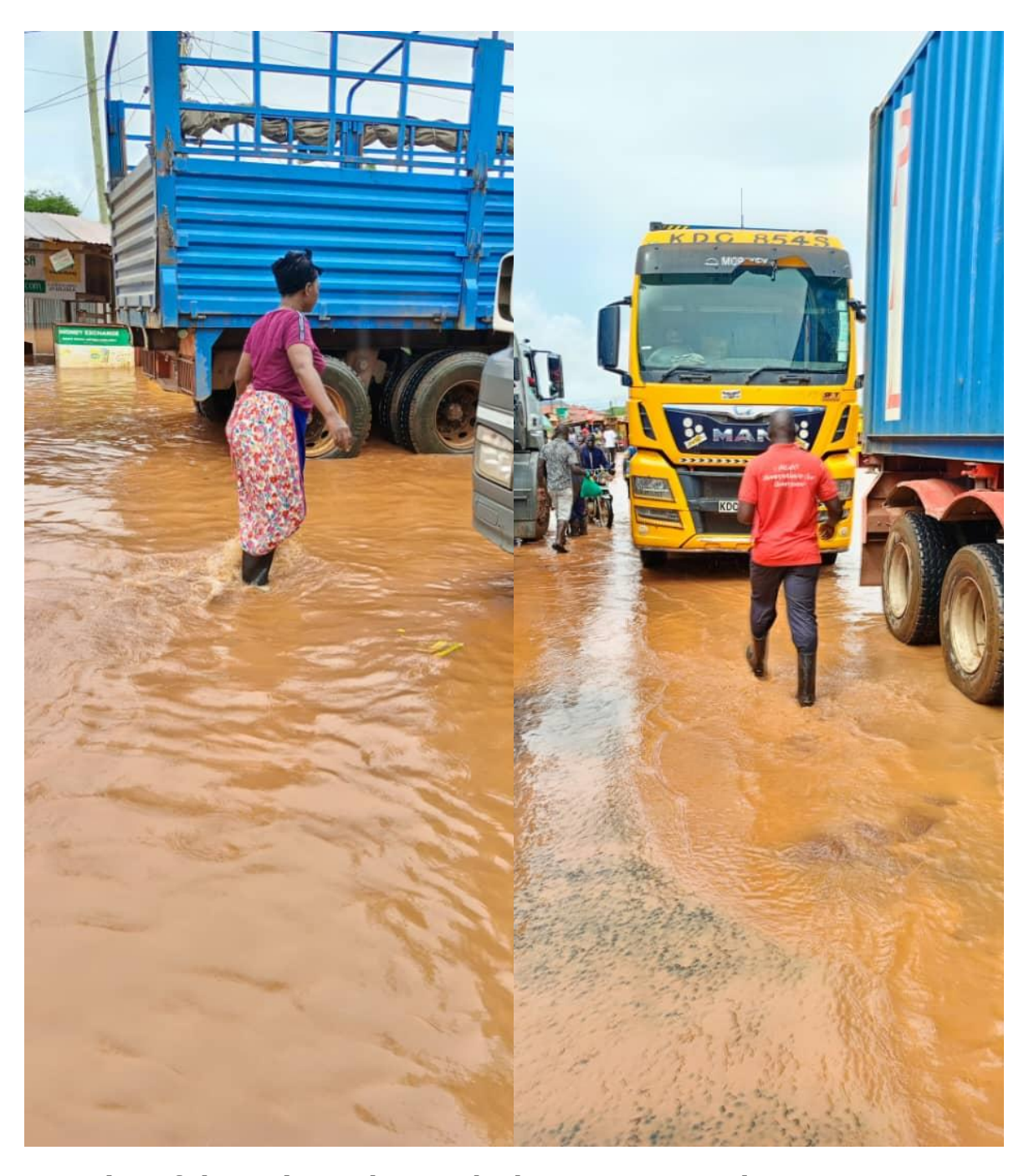
A section of the main road towards the One Stop Border Post.