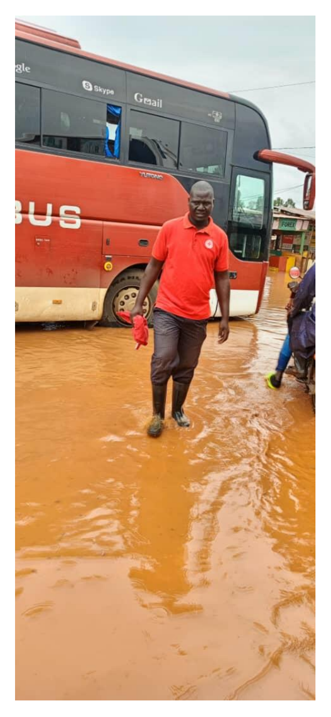
Port Health Staff after interacting/screening travellers in that bus.

From the pictorials above, we can preliminarily foresee the following key challenges, immediately and afterwards.