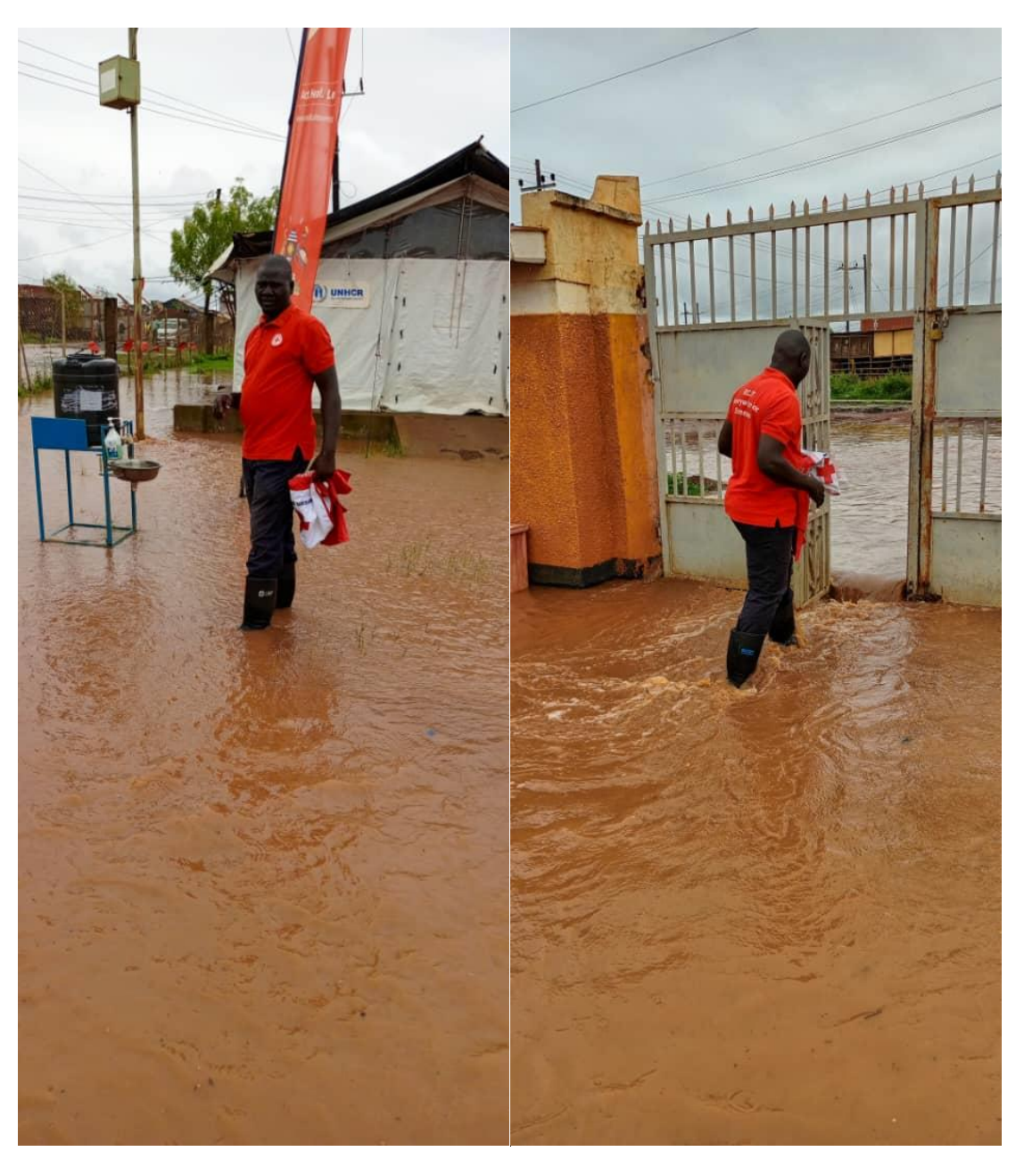
This is the refugee reception centre, where they are screened before being taken to the main camps in other areas.